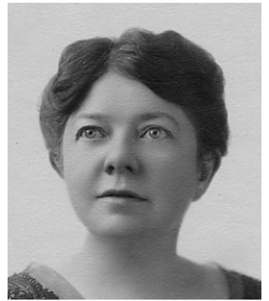
Amy Beach

This Sunday, 8th March, is International Women's Day and, at the morning Eucharist at Holy Trinity the Choir will be singing a new motet to celebrate: 'Peace I leave with you' by female composer Amy Beach (1867-1944). Beach was an American pianist-composer who made her concert hall debut at 16. She became known for her compositions, with her Gaelic Symphony (1894) being the first symphony by a female American composer to be published. Today's motet comes from a set of choral responses, written when she was just 24.