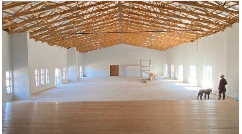
Sharron Dinnie and her dog inspect construction progress on Kwasa's 'White Building'

When is a boundary not a boundary? When it is a meeting place. 'Boundary' signals separation and limitation; 'meeting place' indicates connection and exchange. The story of the Roman Empire is usually based on the narrative of a small city state gradually expanding its boundaries until the Empire covered Europe and western Asia. The decline of the Roman Empire set in – so the story goes – when the barbarians eventually found the strength to cross the boundaries and invade. But the historical reality was that Romans and barbarians had been meeting for centuries. For example, all along the Rhine, towns and markets were built, where ideas were shared, skills learnt and goods exchanged. Of course, occasionally there was conflict; but the "boundary" of the Empire was essentially the place where different cultures met.